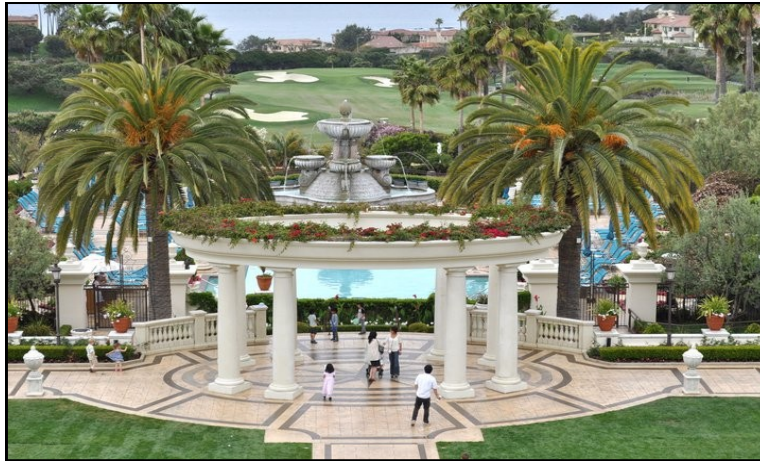
Give Light: The St. Regis Gala 2011

(Read more: http://www.givelight.org/projects/inspiration.htm )